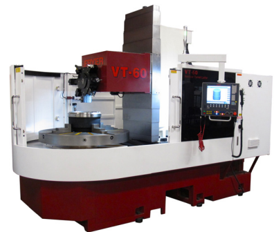
VTL-60 WITH UP TO 60" DIA X 35"