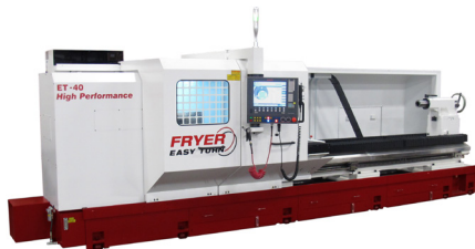
ET-40 48" DIA. X 80"

CTS has added new turning and grinding equipment to meet these capabilities: